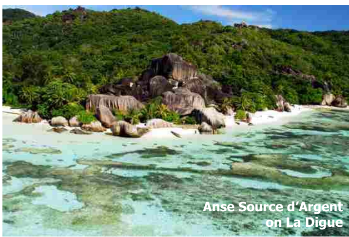
Day 6 - Thursday