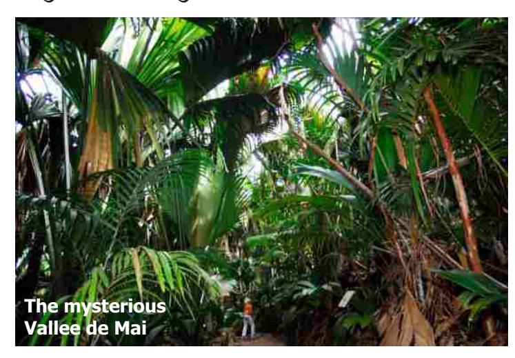
Day 5 - Wednesday